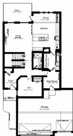
Main Floor Plan