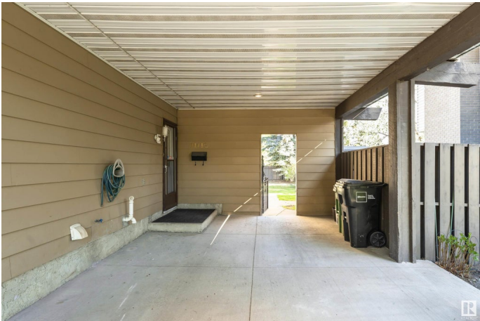
11412 33a Ave NW, Edmonton, AB

Main Floor Exterior Area 629.77 sq ft Interior Area 590.82 sq ft