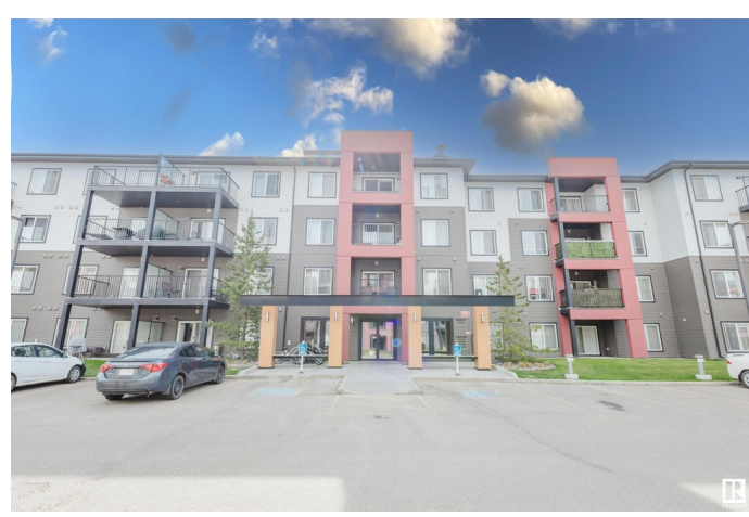
108-340 Windermere Rd NW, Edmonton, AB Main Floor Interior Area 722.75 sq ft